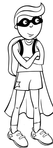
Mighty Jet Pack Jim The 10x Table Champion!

These mighty sporty superheroes are taking part in the Trans-galaxy Superhero Games! Their mission is to practise their times tables along the way, demonstrating mighty skills in multiplying, dividing, and solving word problems!