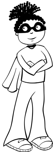
Mighty Supersonic Sinitta The 2x table champion

In this book you will meet three mighty sporty superheroes (and some of their friends):